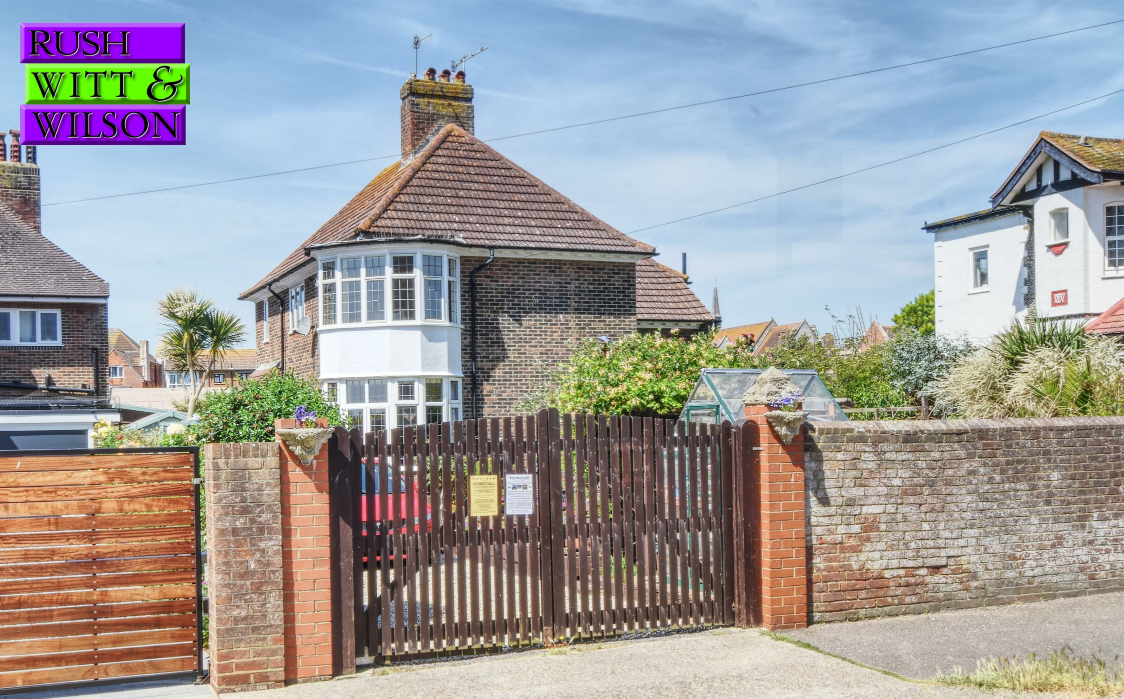
2, Edmar Court Middlesex Road, Bexhill-On-Sea, East Sussex TN40 1LR £335,000